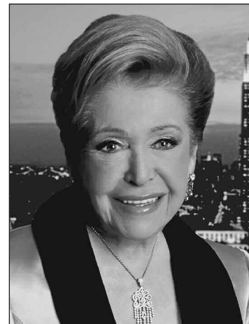
Lifetime Achievement Mary Higgins Clark

...plus lots of other mystery authors and fans!